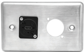
Example of panel mount

Note: the bracket is attached to the host side by default; you may switch it to the device side with a hex screwdriver